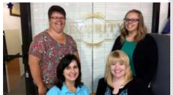
Rochester Branch Staff